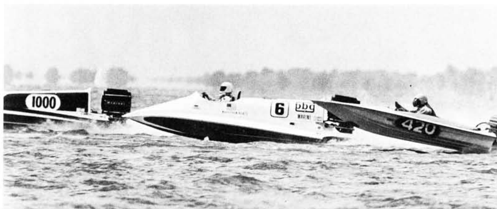
Gusty winds made the St. Mary's course a rough one for all drivers.