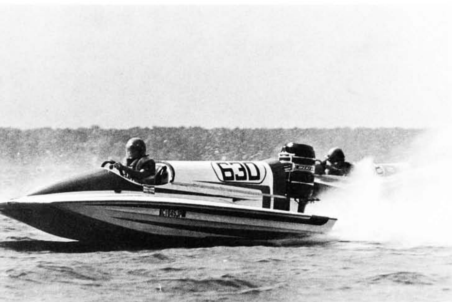
Tunnel hulls had to be especially careful with unpredictable winds and choppy water.

which gave him an unprecedented third straight national championship. Cool Art won by more than a lap over his closest pursuer in the five boat field.